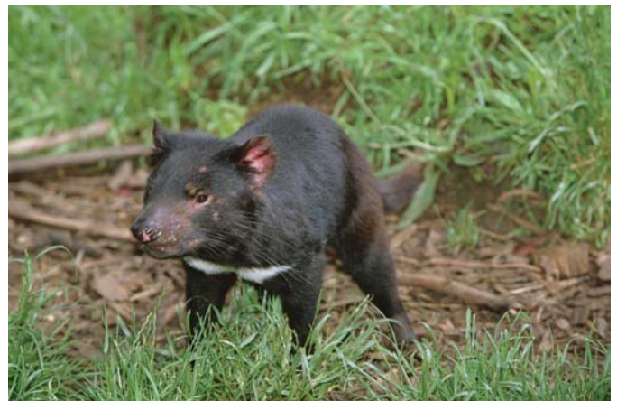
A Tasmanian devil is usually active during the night.

At one time, Tasmanian devils were almost extinct. They were killed off by dingoes, or wild dogs from Australia. They are now a protected species, so their numbers are increasing again.