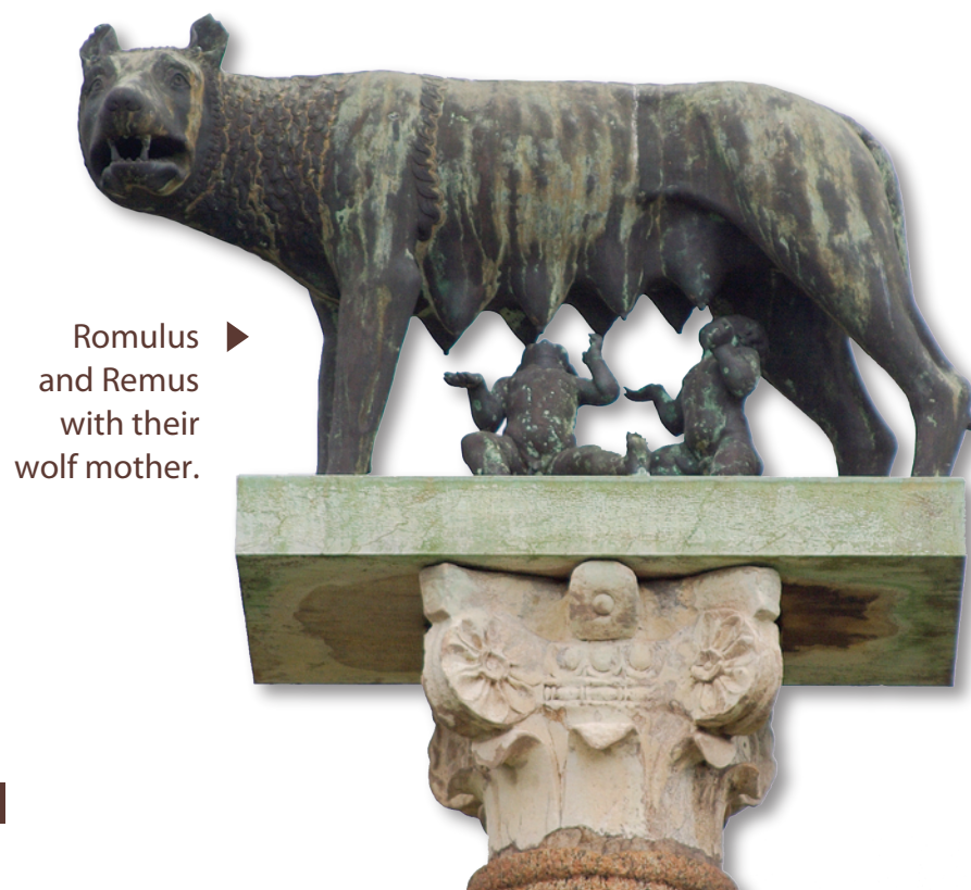
Romulus and Remus with their wolf mother.

Kings ruled early Rome. Then, Rome became a republic . This meant that rulers were elected. The Roman Republic began in 509 B.C. and lasted almost 500 years.