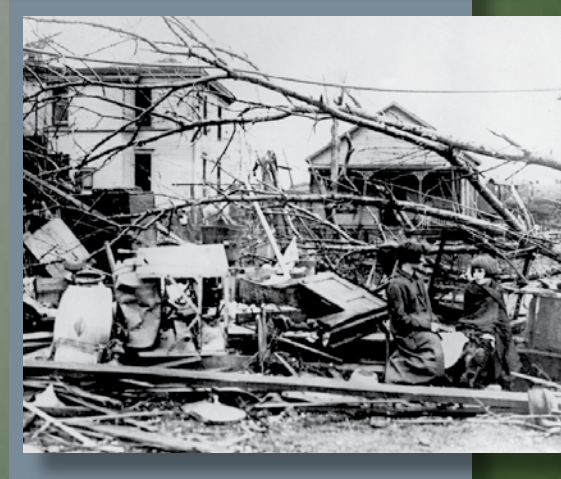
If the vertical supercell keeps going, it starts sucking wind and everything else up the cell. A tornado is born.