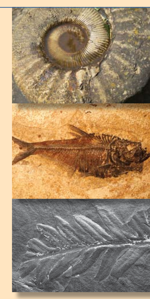
Wegener used fossils like these to try to prove his theory.