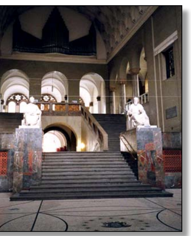
A Physics Hall at the University of Munich

The more he learned, the more he thought about things. He went to Berlin to study with the famous scientists there. He began to study theories of physics. Theories are explanations. They are ways of thinking about and analyzing something to understand what you cannot see.