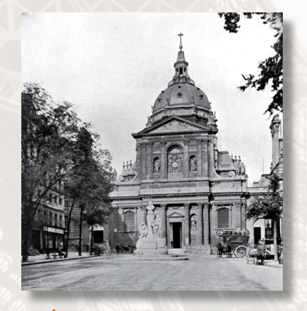
The Sorbonne is Europe's oldest university.

All of her classes were taught in French. Curie only spoke Polish. She learned to read, write, and speak French.