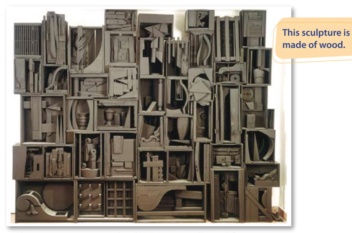
Nevelson , Louise 1899 (or 1900)–1987. "Sky Cathedral III", 1960. (Assemblage made from 95 parts). Wood relief, painted. 300 \times 354 cm. Private collection.

What 2-D shapes can you see in this sculpture? Louise Nevelson, an American sculptor, made it.