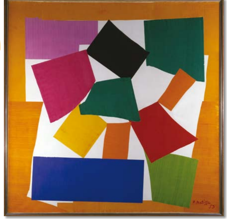
© Desc: L'Escargot Artist: Matisse, Henri: 1869–1954: French