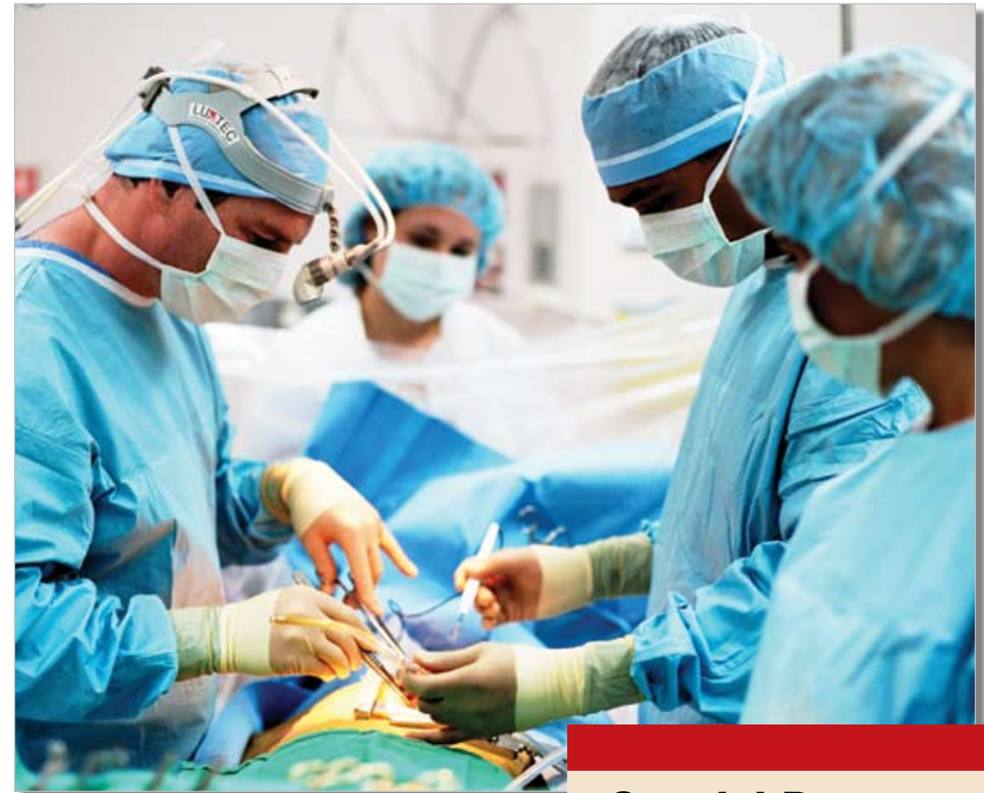
◆ Surgeons operate on a patient