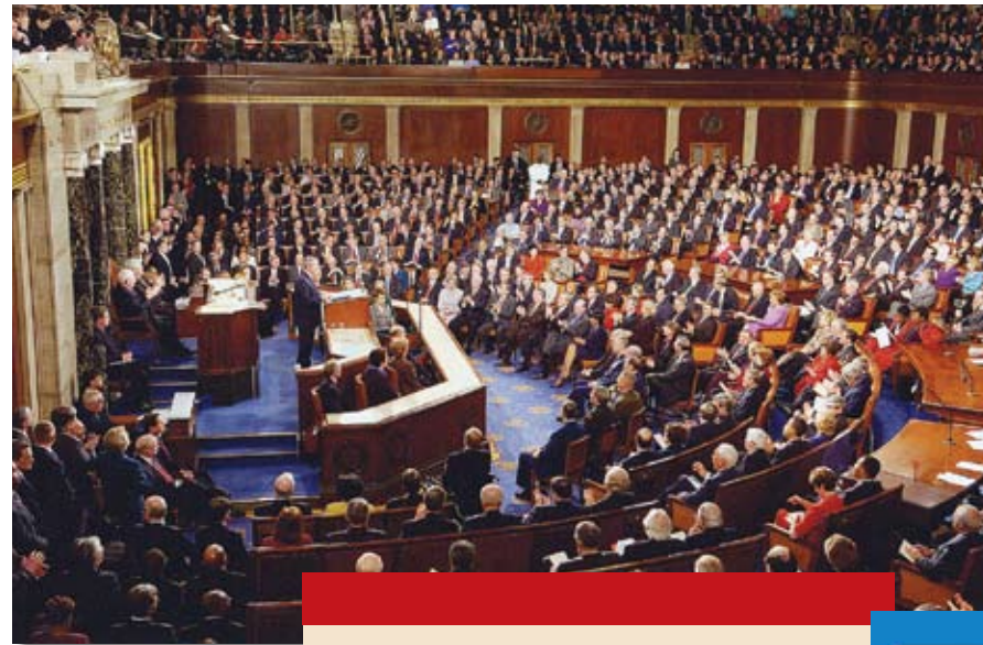
◀ The House of Representatives meets in this room.