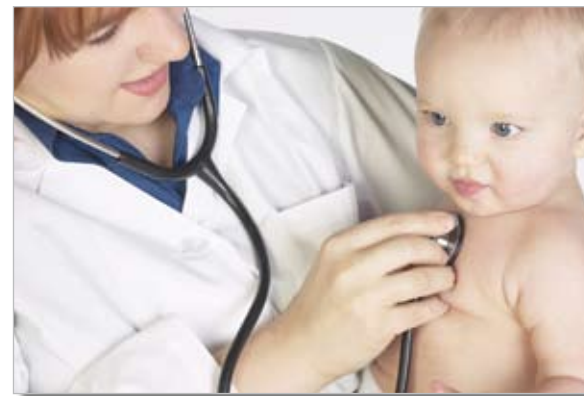
◆ A pediatrician

Some doctors are called surgeons (SUHR-juhnz). Their jobs are very hard. They operate on people. That means that they fix things inside people's bodies. This can help save people's lives.