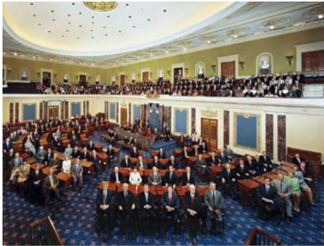
◆ This is the room where the Senate meets.

The Senate is one part of Congress. It has 100 members. That is two from every state. The vice president of the United States is the president of the Senate. He votes on laws if there is a tie.