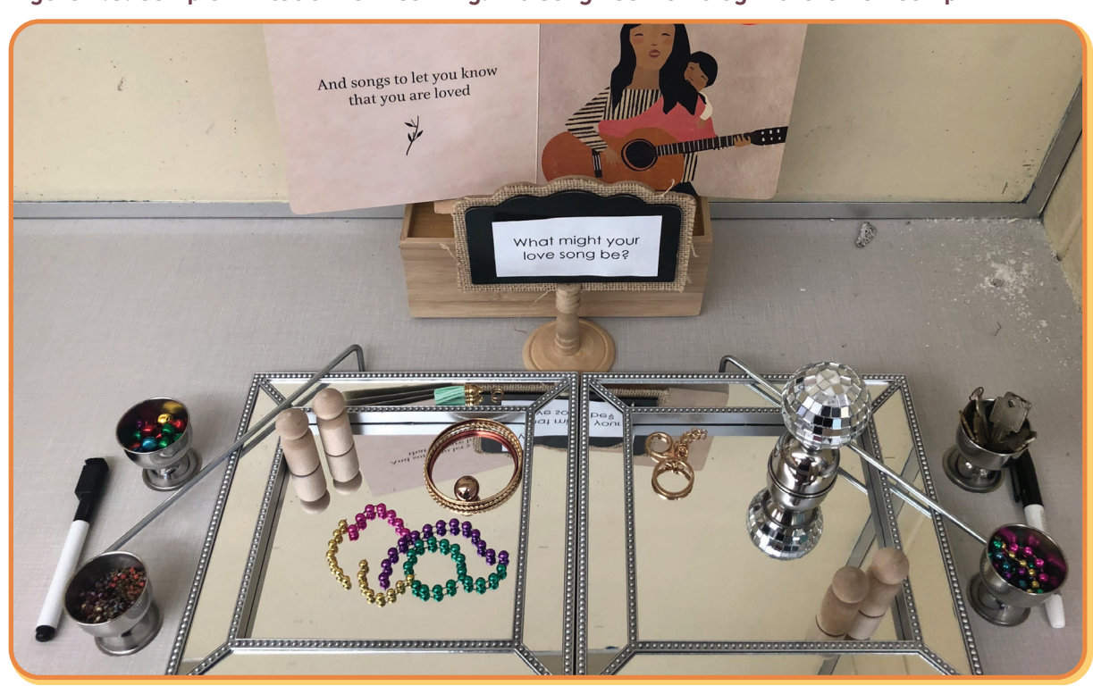
Figure 4.3. Sample Invitation for Learning: We Sang You Home by Richard Van Camp

In the Invitation for Learning in figure 4.3, the book We Sang You Home by Richard Van Camp is offered alongside mirrors and materials such as a small disco ball, bells, bead necklaces, metal pieces, keys, peg people, and metal rods.