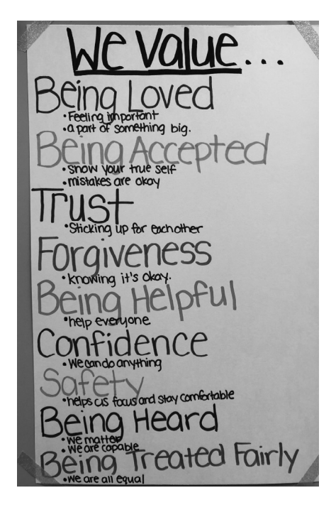
Figure 4.2: Classroom Values

Students loved this activity because they really valued being able to cocreate and contribute to a sense of classroom identity. Decision-making activities during which all students have a say contribute to creating an equitable, student-centered classroom.