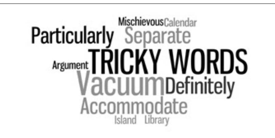
Figure 3.3 Tricky Words Word Cloud (Created in Wordle)

Figure 3.4 Completed WordSift for "I Have A Dream" Speech by Dr. Martin Luther King, Jr. (www.wordsift.com)