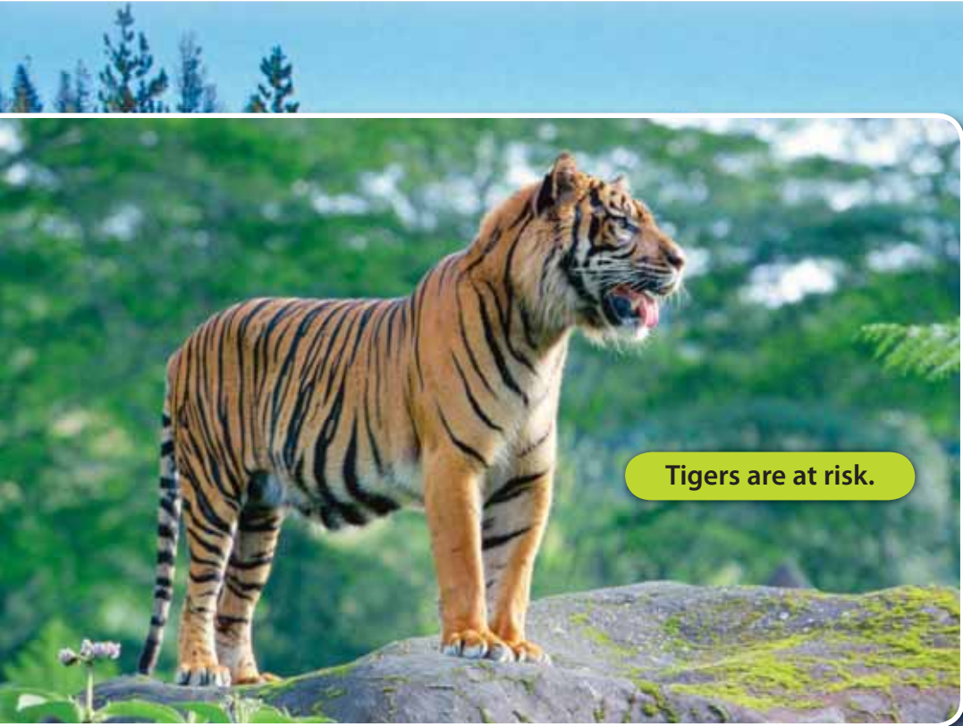
Tigers are at risk.

Many animals and plants are in danger. More disappear each year. This is because some of the places where they live have changed. And some animals are hunted or over-fished.