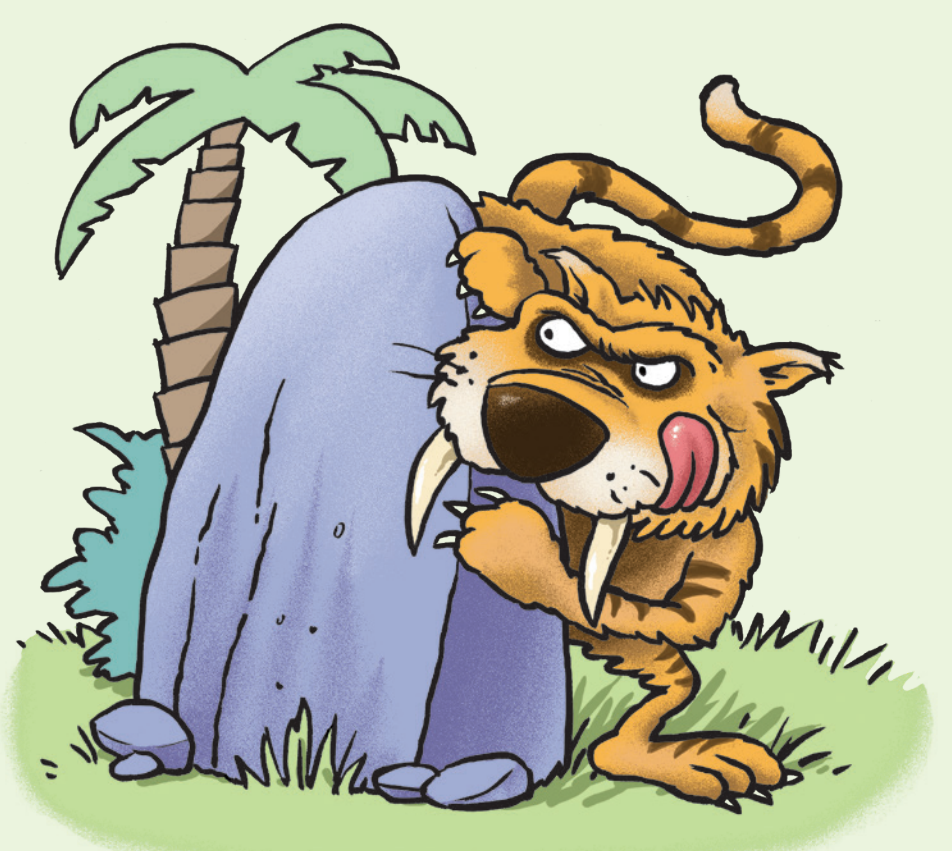
The [Nd (in more ways than one)

Cave Girl and Cave Boy were so busy yelling insults at each other that they didn't notice BIG trouble just around the corner . . .