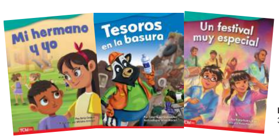
Literary Text/Fiction 30 SpanishTitles